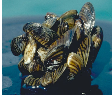
Zebra mussels.

other equipment for vegetation, removing it, and disposing of it properly. Zebra mussels have been the target of awareness, education, and prevention in recent months. They were first found in the Duluth-Superior harbor in 1989 and have since